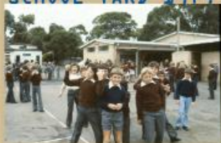
SCHOOL YARD 1979

Friday 2nd Nov 2018: Final date for acceptance of offers made.