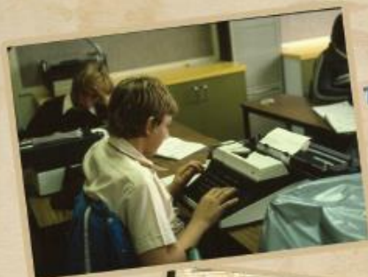
TYPING CLASS 1980